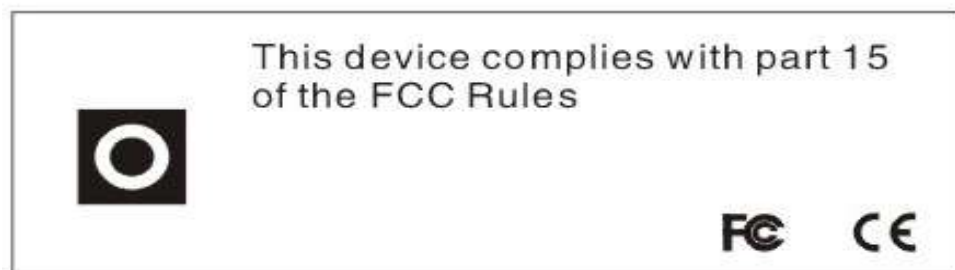
Table 2 : Back panel